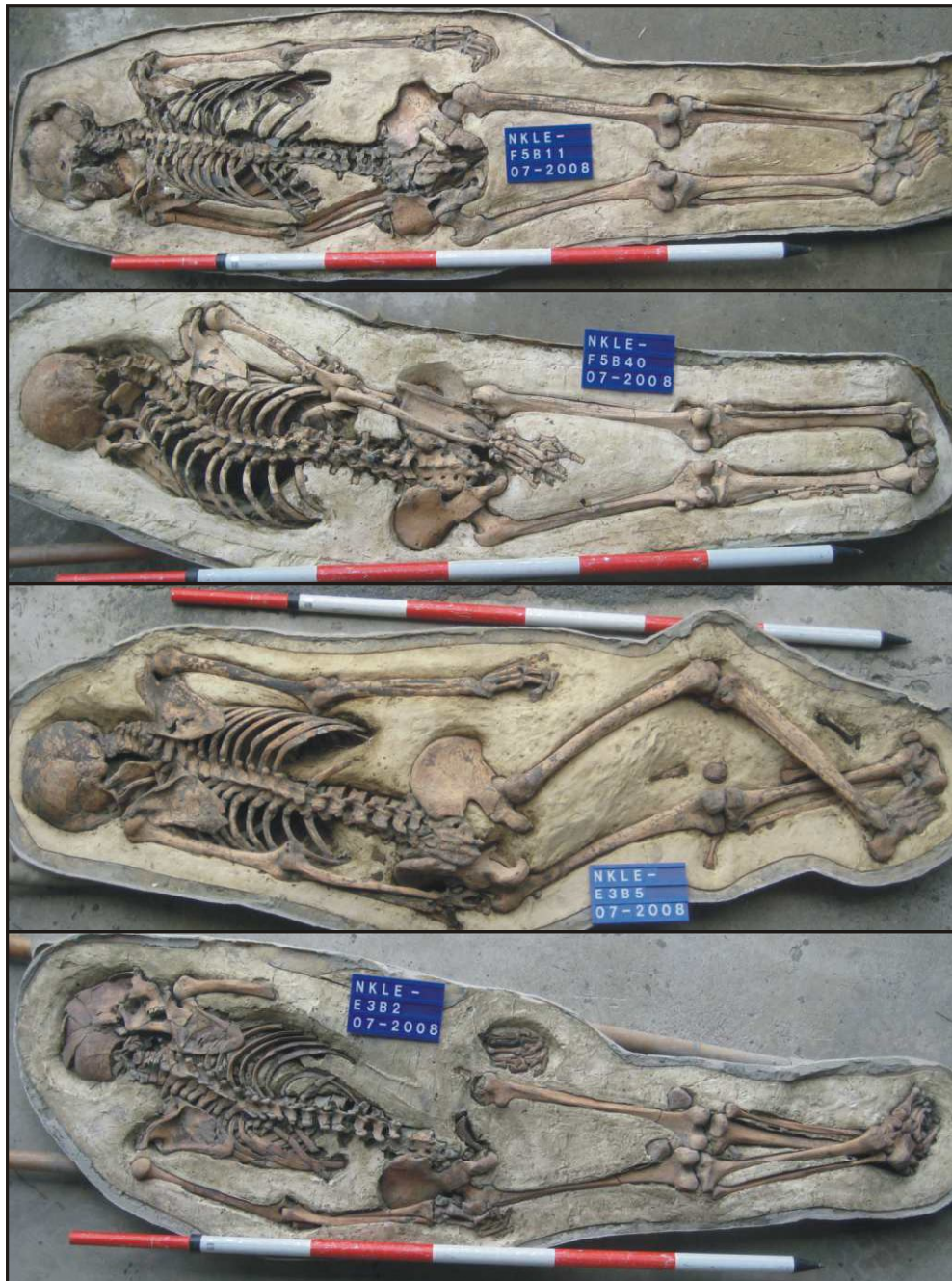
Fig. 1: Some of the adult male burials from the NKLE site showing state of preservation and completeness prior to this study.