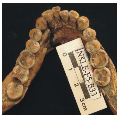
Fig. 10: NKLE F5 B33, a young adult female. Occlusal view of mandibular teeth. A carious lesion is visible in the left second molar and there is moderate to marked dental attrition.

Dental caries is a demineralization of the tooth structures caused by organic acids produced by bacterial processes involved in the fermentation of dietary carbohydrates (Hillson 2008:313). The overall frequency of carious teeth (1.9%) in the NKLE teeth, sexes combined, is low. There is no significant difference in the frequency of carious teeth observed in males (1.7%) and females (2.1%) from this site (Table 3). Some examples of dental caries in the NKLE teeth are shown in Figures 7, 10, and 11.