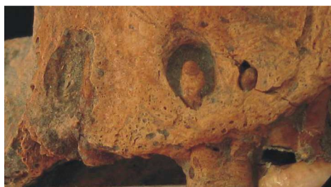
Fig. 13: NKLE F5 B29, a middle-aged male. Alveolar defects (periapical abscesses) are observed exposing the roots of the maxillary left first and second molars and third premolar.

The frequency of alveolar defects, or periapical inflammation, in the NKLE series is 1.0% of tooth sockets (Table 3 and Figure 13). There is no significant difference in the frequency of alveolar defects in the adult male sockets (1.3%) and female sockets (0.5%).