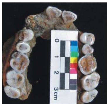
Fig. 6: NKLE E3 B1, a young adult male. The maxillary dentition showing tooth ablation of the lateral incisors and canines, shovel-shaped central incisors, and moderate wear of occlusal surfaces of the first molars.