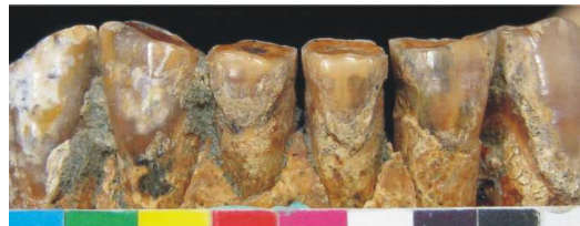
Fig. 15: NKLE F5 B27, a middle-aged male. Anterior mandibular teeth exhibiting dental calculus deposits and moderate tooth wear.