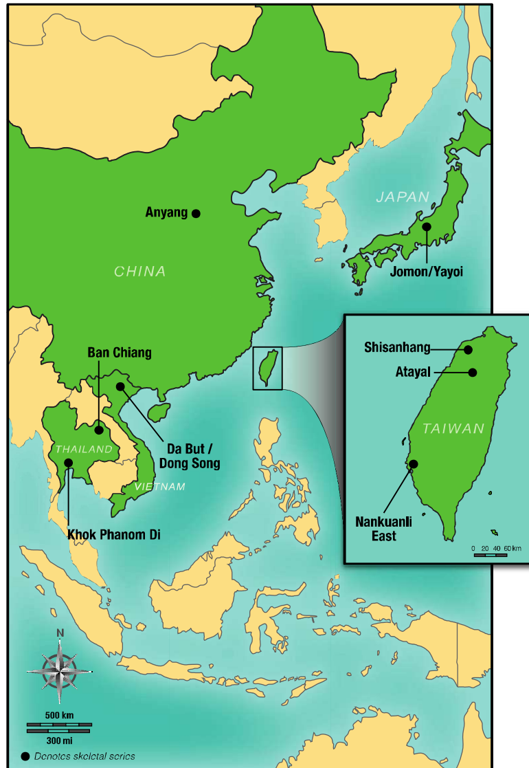
Fig. 3: Map showing the approximate locations of the skeletal series used in the study.