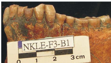
Fig. 9: NKLE F3 B1, young adult female. Anterior view of the anterior mandibular teeth; the left canine and adjacent lateral incisor exhibit multiple LEH.