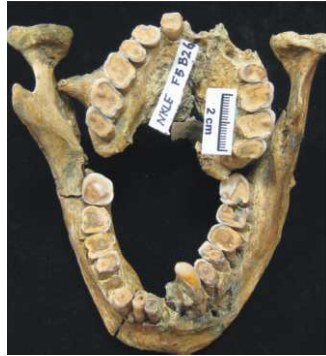
Fig. 4: NKLE F5 B26, a middle-aged male. Maxillary and mandibular teeth exhibiting marked and uneven wear. A dental caries is present on the distal surface of the left mandibular second molar.