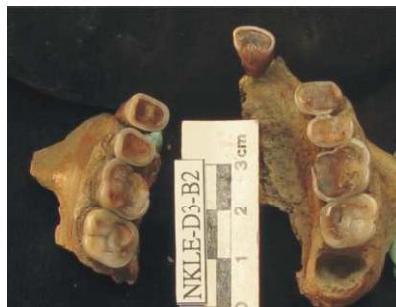
Fig. 5: NKLE D3 B2, a young adult male. Maxillary teeth exhibiting marked attrition and tooth ablation of the maxillary lateral incisors and canines.