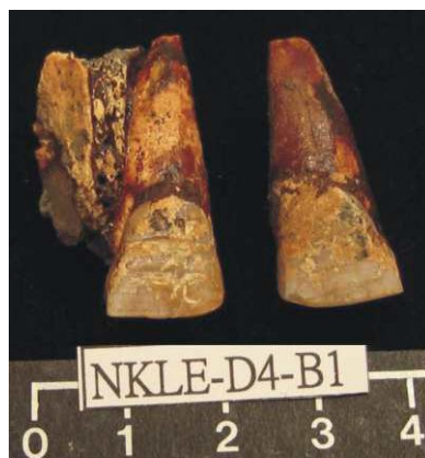
Fig. 7: NKLE D4 B1, a young adult female. The maxillary central incisors exhibit LEH.

6 Advanced (pulp exposure or wear to the root).