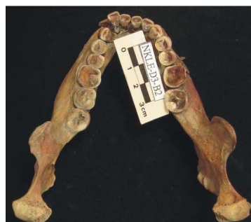
Fig. 16: NKLE D3 B2, a young adult male. Occlusal view of mandibular teeth that exhibit moderate wear.

Tooth-on-tooth wear that results in wear facets on the teeth involved is described as attrition (Hillson 2008). In the NKLE series occlusal wear was recorded on an absent, slight, moderate, and marked gradient reflecting the exposure of the dentin as wear progresses. The overall incidence of advanced dental attrition, tooth wear that exposes the dentin (moderate) and pulp cavity (marked), is 52.1% in the NKLE adults. A lower, but not statistically significant, frequency of advanced dental attrition is observed in adult female teeth (43.3%) than in adult male teeth (57.6%) from NKLE (Table 3). Several examples of tooth wear in the NKLE dentitions are shown in Figures 7 - 10, 15, and 16.