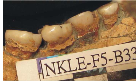
Fig. 14: NKLE F5 B33, a young adult female. Left mandibular teeth exhibiting marked dental calculus deposits.