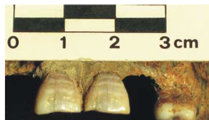
Fig. 8: NKLE E3 B1, a young adult male. Anterior view of the maxillary central incisors exhibiting linear enamel hypoplasias and tooth ablation.